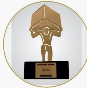
Jury Special Project Awards-Biopharma ( ATLAS LOGISTICS ) 2018