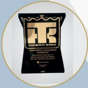
Thermo King Cold Cube Certificate ( DOĞUŞ AUTO ) 2015