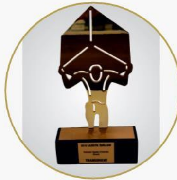
Railway Forwarder of the Year Award ( ATLAS LOGISTICS ) 2016