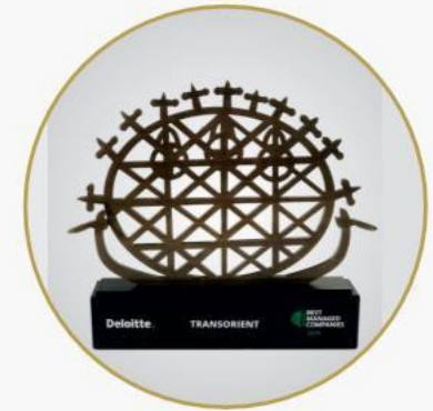
Best Managed Companies ( DELOITTE ) 2019